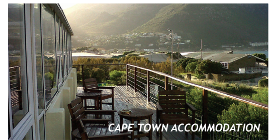
CAPE TOWN ACCOMMODATION